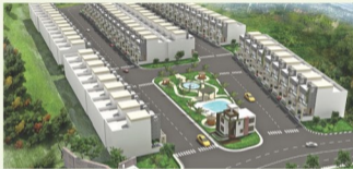
Site : 2.5 km, Main JaipurBikaner Road, Near Hanging Gardens, Bhankota, Ajmer Road, Jaipur