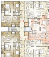
FIFTH FLOOR PLAN | BLOCK - A