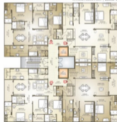
TYPICAL FLOOR PLAN | BLOCK B