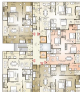
TYPICAL FLOOR PLAN | BLOCK A